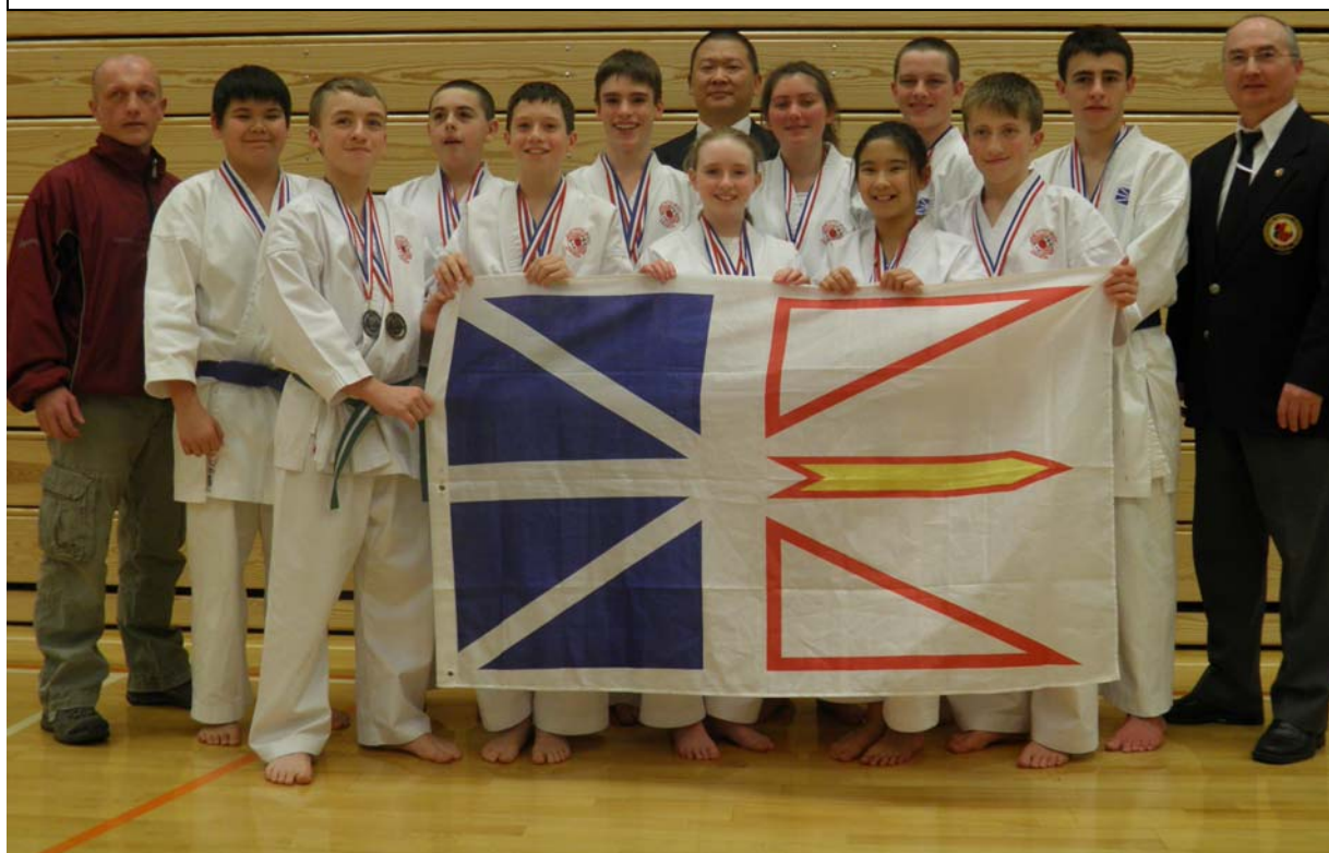
Karate NL Team 2012 – Atlantic Canada Karate Championships